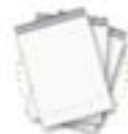
Plastic shipping envelopes