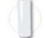
Pallet wrap & stretch film