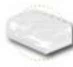
Wood pellet bags