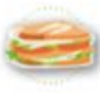
Ziploc & other reclosable food storage bags